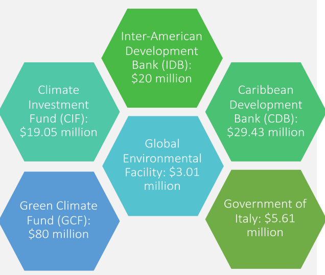
Figure 1: SEF's Participating Organizations

The SEF solution facilitates the blending of commercial equity sourced from the developer (often provided in kind in the form of access roads, well pads and ancillary investments), with concessional finance from multilateral sources to achieve a pressing development purpose. CRGs minimize the risk of exploration; grants are used to fund capacity building for geothermal analysis and for building environmental and social safeguards. The SPV, created by the government and the geothermal developer, becomes the entity borrowing from the IDB. Its purpose is to finance the assessment of drilling conditions, the